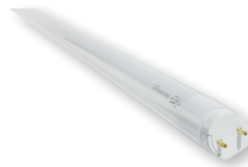
BAA Compliant LED Tubes