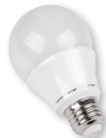
7W & 9.9W LED A-Lamp