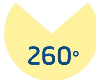
Revolution Lighting Light Distribution