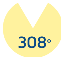
Revolution Lighting Light Distribution