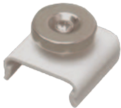
Magnet Mount* SKU: 15G00M-101