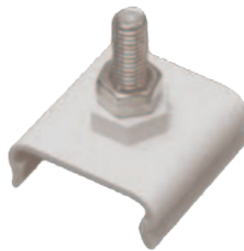
Threaded Stud Mount SKU: 15G00M-102

* Note: External-Driver Tubular LED Troffer Retrofit Kits include two Magnet Mounts per tube. Threaded Stud Mounts must be ordered as optional mounting accessories.