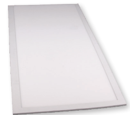
2' x 4' Dimmable G2 Eco Thin Panel