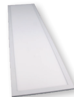
1' x 4' Dimmable G2 Eco Thin Panel