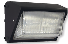
G2 Wall Pack 35W/50W