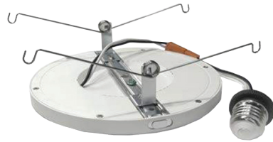
Torsion Clip Mount (12W, 18W & 24W)

[Use with existing recessed light fixture cans (pots).]