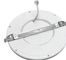
Drywall Spring Clip Mount (All Models)

[Use with existing recessed light fixture cans (pots).]