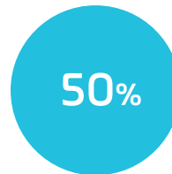
vs. Similar Fluorescent Lamps