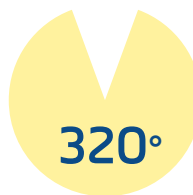
Revolution Lighting Light Distribution